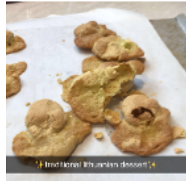
Messy matcha macarons

I finally took my cookies out of the oven. The results were disastrous. Ever the optimist, I took the opportunity to gaslight people into thinking the result was a traditional Lithuanian dish.