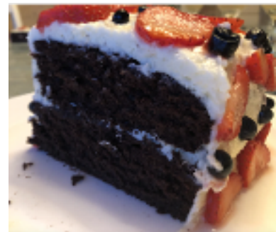
Chocolate cake with vanilla swiss meringue buttercream and berries