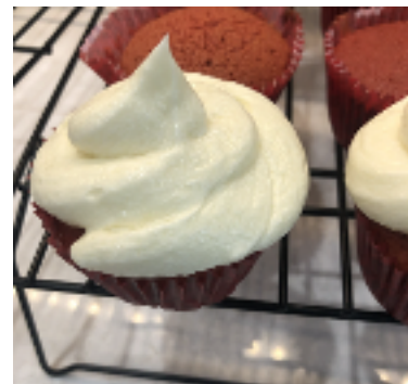
Red velvet cupcakes with cream cheese frosting