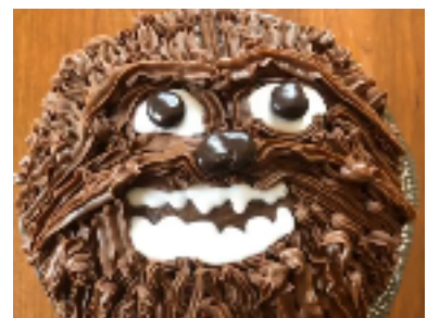
Chocolate "Chewbacca" cake